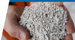
NOVU-K - Potassium sulphate