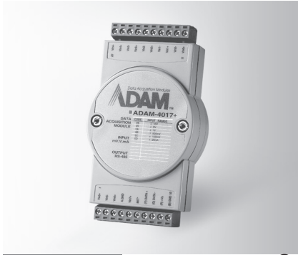
ADAM-4017+ FCC CE RoHS LISTED E190861 ETC.

8-ch Universal Analog Input Module with Modbus