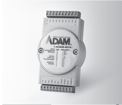
ADAM-4018+ FCC CE RoHS LISTED E190861 ETC.