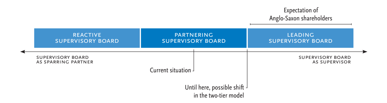
Figure 1: The role of the supervisory board.

The role of supervisory boards in the Netherlands is moving towards more of a partnership role, and even a leading one, with supervisory boards demanding more information and placing greater emphasis on their supervisory task. "In today's world, supervisory board members have become supervisors rather than sparring partners," commented one chairman.